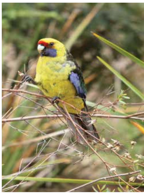
Green Rosella on mountain correa. Males are slightly larger and more brightly coloured than females.