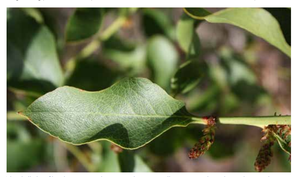
The phyllodes of hop bitterpea are about 10 cm long, ovate-elliptic to ovate-lanceolate with wavy edges.

broadly wavy edges. Phyllodes have fewer stomates (pores) than leaves, so less water is lost to the air. The flowers occur from October to November in Tasmania and are yellow and