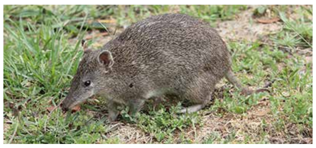
Southern Brown Bandicoot.

Around the house here we've only ever seen southern brown bandicoots - but one day I was taking the necessarily relaxed drive down our track when an EBB fell out of the sky onto the bonnet. Freshly dead - but showing little sign of injury. I looked back to see a large blackwood branch hanging over the track. I surmise that the landrover surprised a raptor about to launch into dinner. The suspects would be Grey Goshawk or Collared Sparrowhawk as both are regularly seen at Black Sugarloaf.