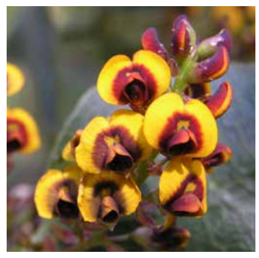
Flowers of hop bitterpea (Daviesia latifolia).

The hop bitterpea belongs to the Fabaceae (pea) family, and grows up to 3 metres tall. Characteristic of the Daviesia genus, it has phyllodes instead of leaves. They are ovate-elliptic to ovate-lanceolate to about 10 cm long, strongly veined, leathery, alternate, with