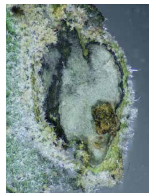
Gall on dogwood with tiny 0.1 mm long invertebrate pellet.