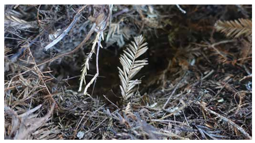
An Eastern Barred Bandicoot shelter under a California Redwood tree.

Another memory. I use a converted garden shed as my office. One afternoon as I was walking towards the shed, a bandicoot shot