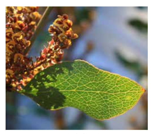
Conspicuous veins on leaf of hop bitterpea.

Plant fragrance is due to the release of volatiles from the flowers, leaves or stems of plants. Volatiles may protect against abiotic stresses (e.g. temperature extremes, drought or excessive water, salinity or mineral toxicity), herbivores, pathogens or competitors. Alternatively they may be produced for the attraction of pollinators, mutualistic microbes, seed dispersers, predators or parasitoids. They have also been found to be a form of communication between plants. For example, a plant may release particular volatiles to indicate to neighbouring plants that it is being eaten