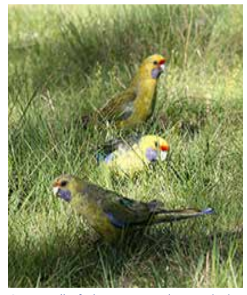
Green Rosellas feeding on grass seeds. Young birds (foreground) have darker green plumage that gradually brightens with each moult.