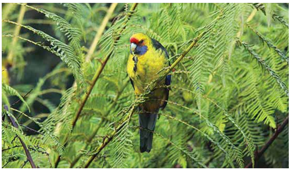
Green Rosella feeding on treefern (Dicksonia antarctica) spores.

In early November numerous eucalypt leaves with bright red spherical galls fall from the